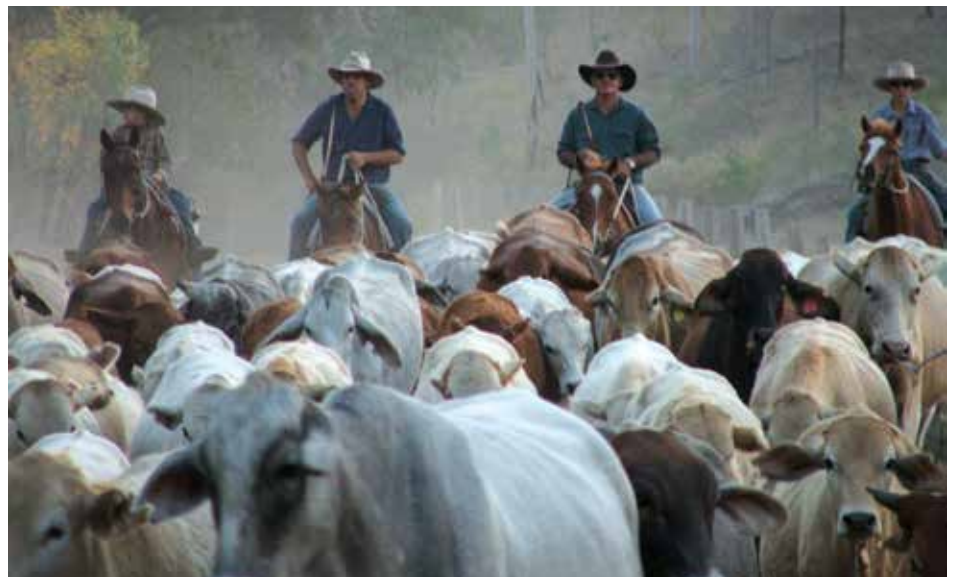
Johne's disease new national framework focuses more on managing biosecurity on-farm rather than through disease regulation.

As the Australian cattle industry finalises the transition to a new framework for managing JD, producers are encouraged to implement their on-farm biosecurity plans.