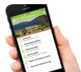
Farm biosecurity made easy by following the simple steps within the app to create a biosecurity plan personalised to your farm.

To download the FarmBiosecurity app, simply search for 'FarmBiosecurity' in the App store or Google Play. Those with a Windows-based smartphone will also be catered for, with a Windows-ready version of the app coming soon. For more information and instructions on how to use the app, go to the FarmBiosecurity app page (www.farmbiosecurity.com.au/farmbiosecurity-app)