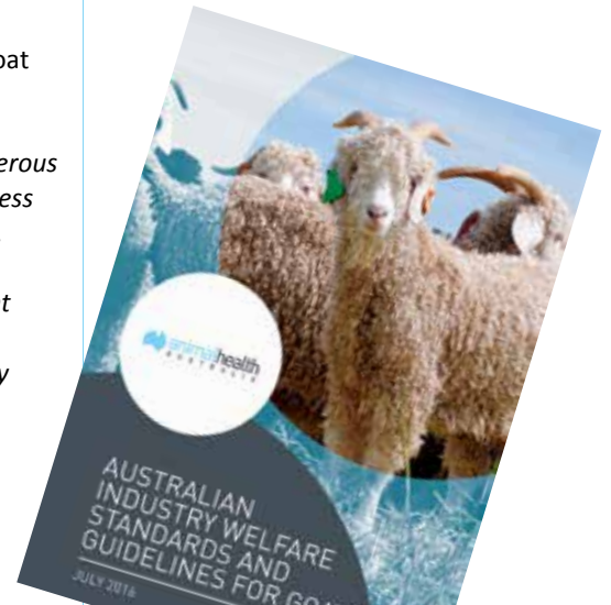
The Australian Industry Welfare Standards and Guidelines for Goats is a must-read for all goat producers within Australia

Although the document is a voluntary guide, it still has the ability to inform a nationally uniform approach to ensuring goat welfare is adhered to.