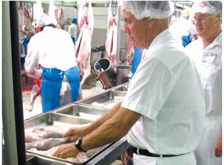
Technological reforms now allow sheep producers to acquire all their information from one visit to the myMLA website.

Reports from NSHMP monitoring have been mailed to producers by some state Departments of Agriculture/Primary Industry at varying intervals. South Australia has value-added to the national project through their Enhanced Abattoir Surveillance Program and feedback has been mailed out twice weekly for many years.